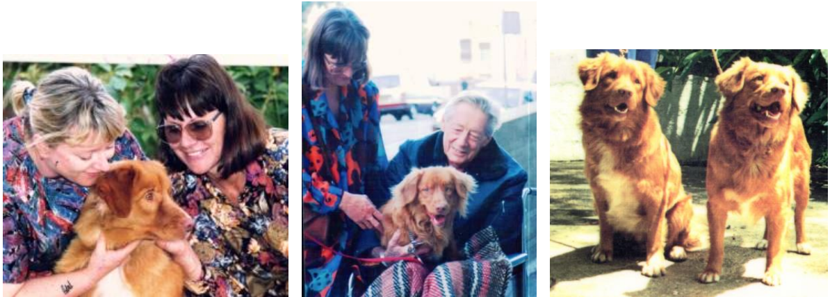
Left: Shilo 1991 Centre: Bridie 1992 Right: 1994