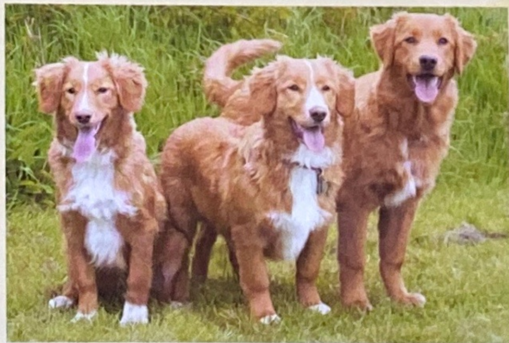
Left to right

Multiple Ch Show winning team including Crufts 03/04/05