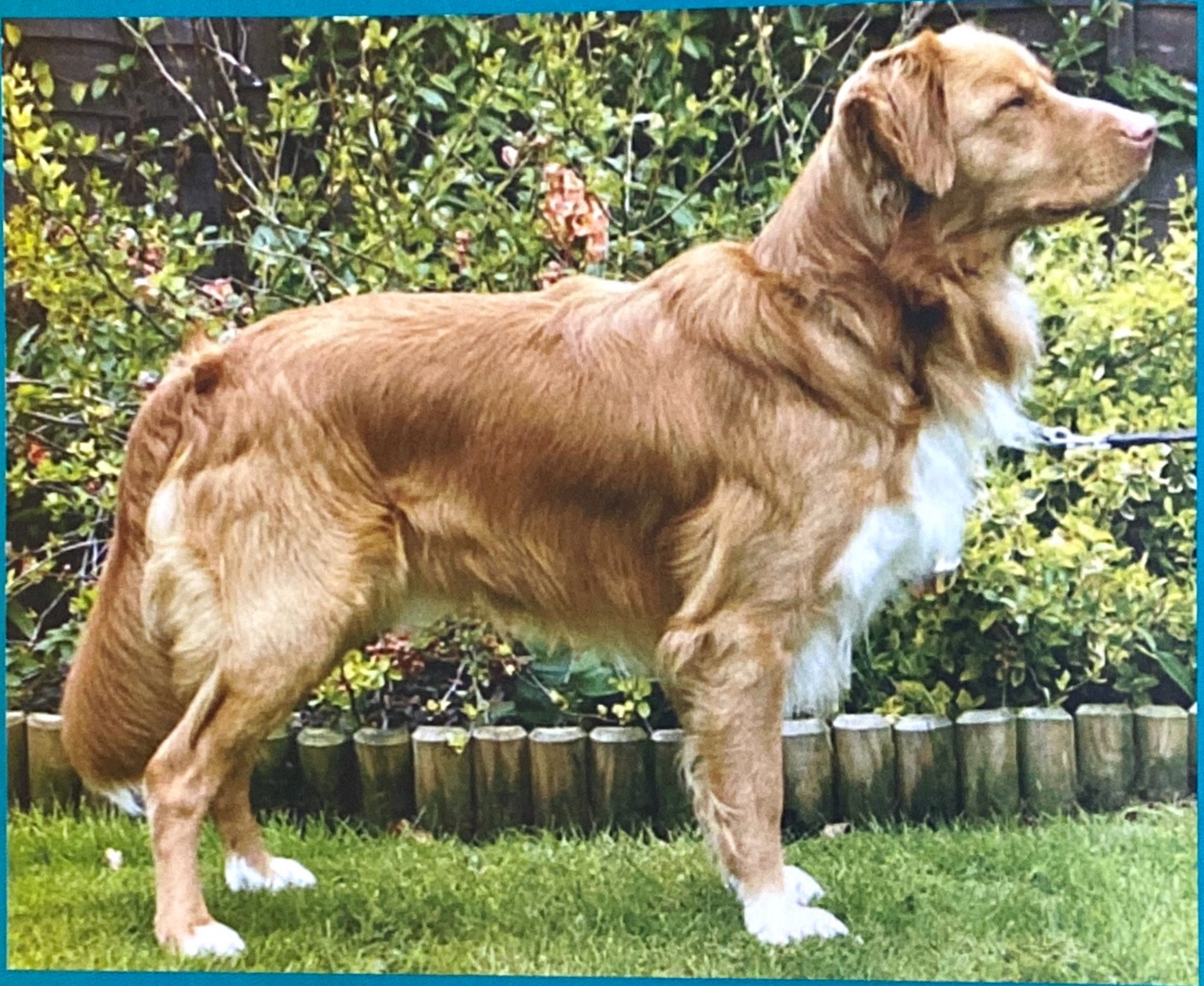
Kennel Club as the Nova Scotia Duck Tolling Retriever.

The Toller is a medium sized, powerful, compact, balanced dog, the smallest of the retriever breeds, he is confident, highly intelligent, easy to train and playful with a high degree of agility, he is alert, determined, and quick, with a keen desire to please, he makes an ideal family pet, but is definitely not for the inexperienced owner. He is a strong and able swimmer and is a natural and tenacious retriever on land and from water, setting himself for springy action the moment the slightest indication that retrieving is required.